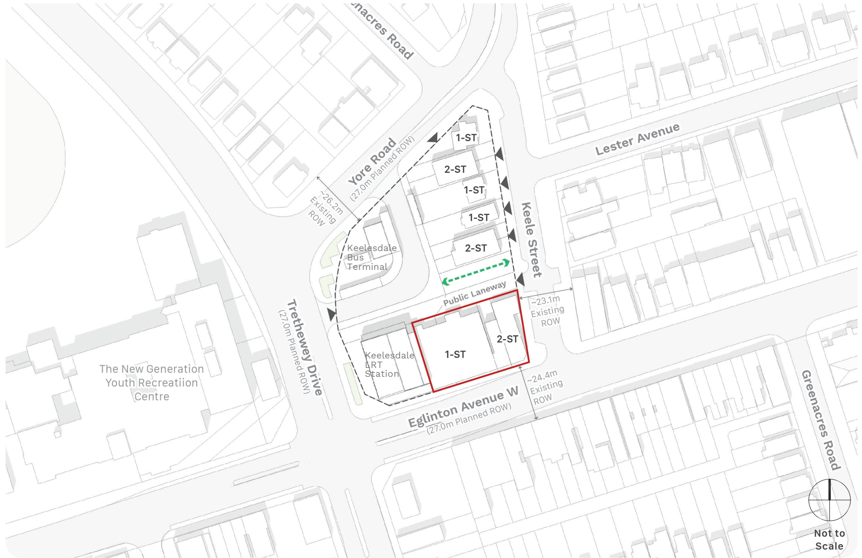
Figure 5 - Vehicular Access