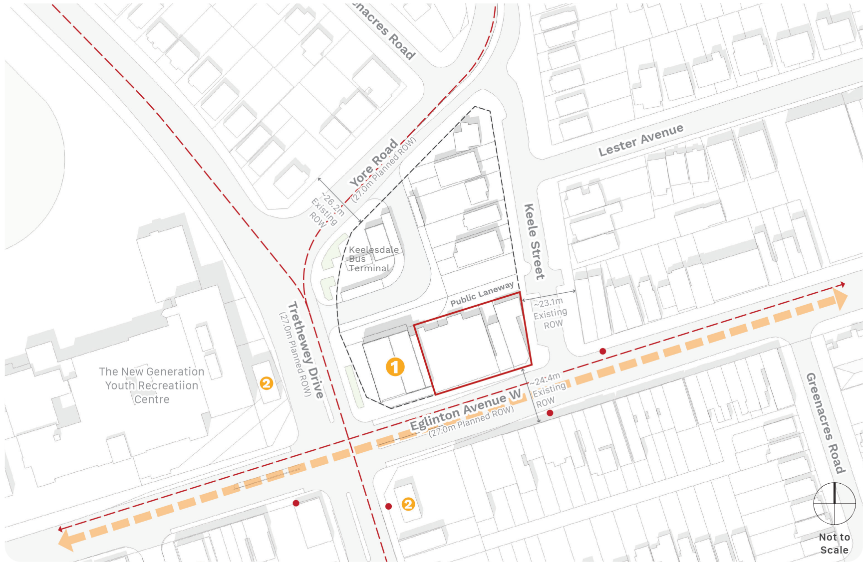
Figure 4 - Existing Road Network