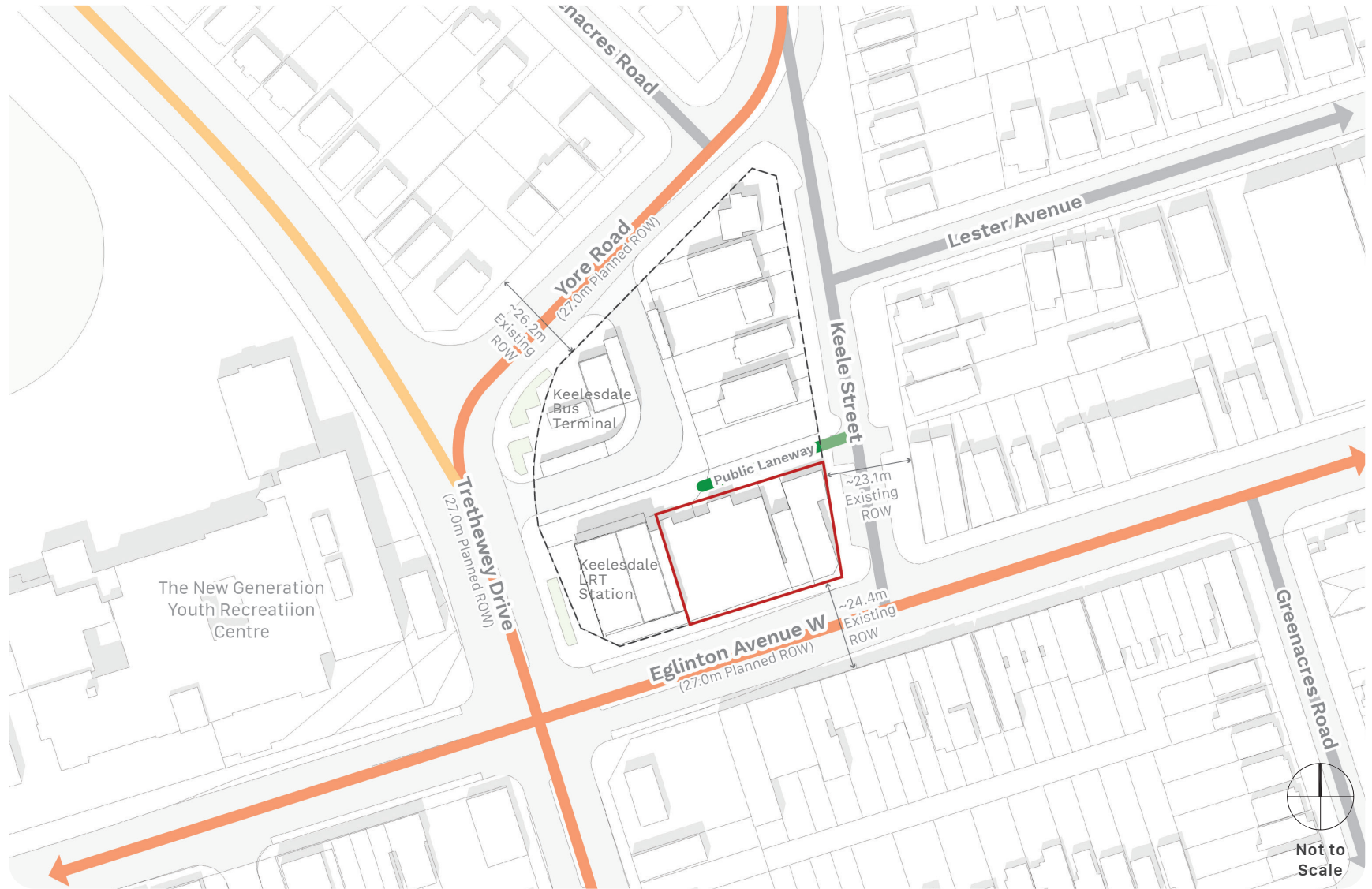
Figure 3 - Road Network