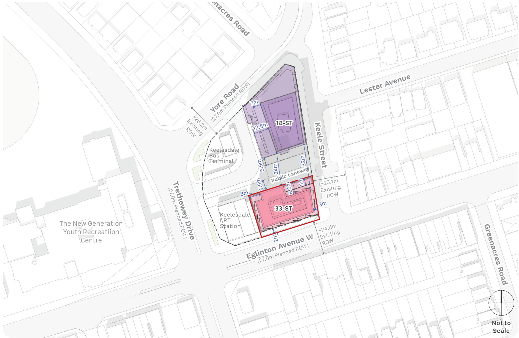
Figure 7 - Setback and Separation Distances

Legend Subject Site Block Context Plan Boundary Proposed Development Active Application # Proposed Heights #m ↔ Setback and Separation Distances