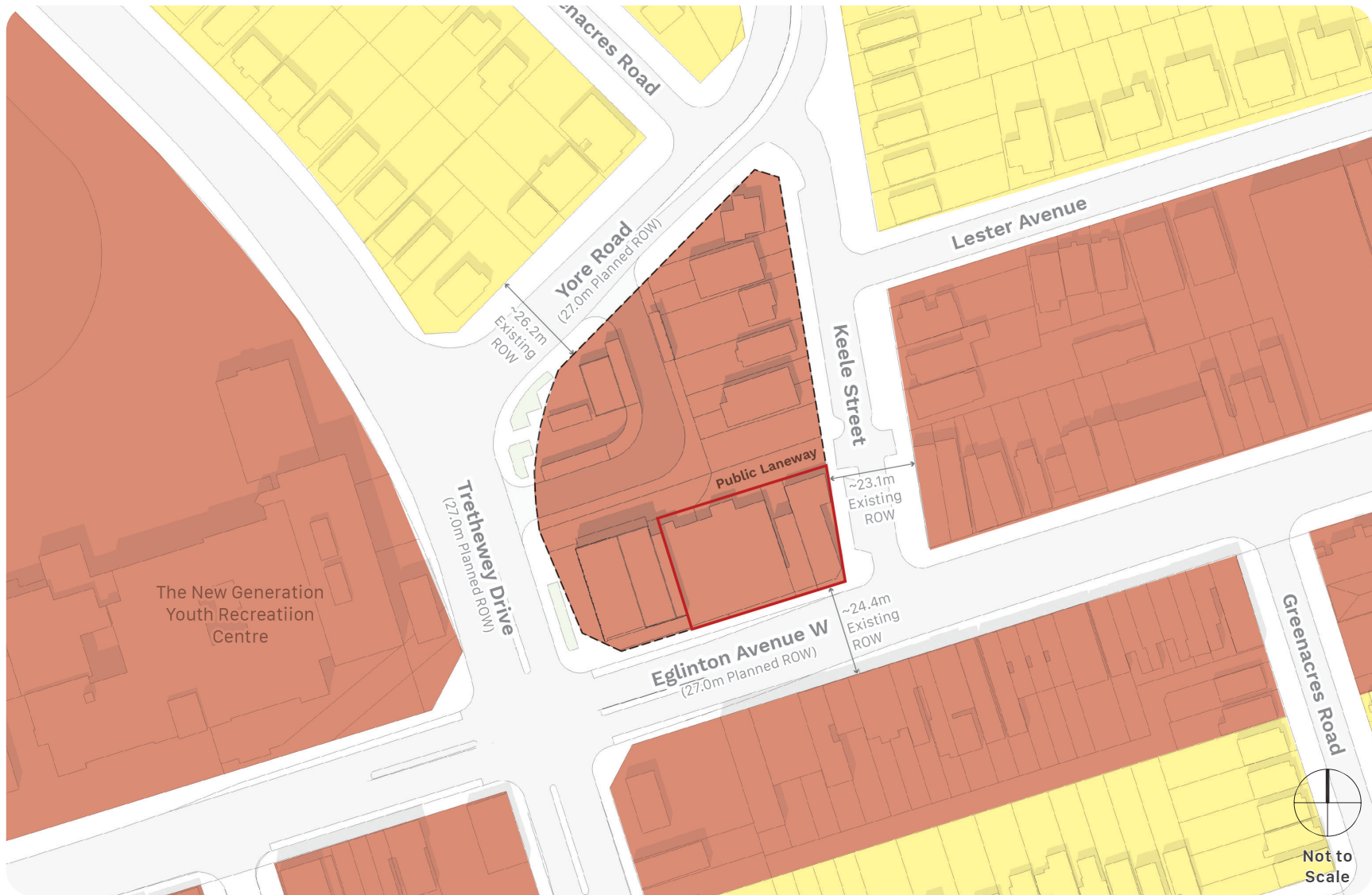
Figure 2 - Land Use Designations (As per the Official Plan Land Use Map 17)

Legend Subject Site Block Context Plan Boundary Neighbourhoods Mixed Use Areas