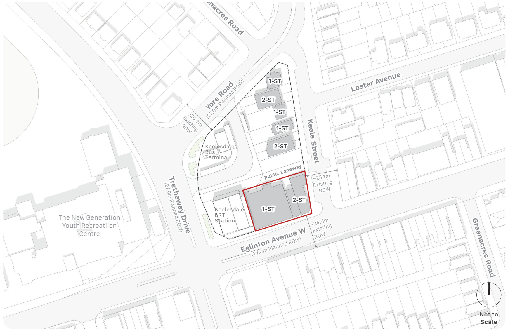
Figure 1 - Existing Context

Legend Subject Site Block Context Plan Boundary Existing Buildings # Existing Heights