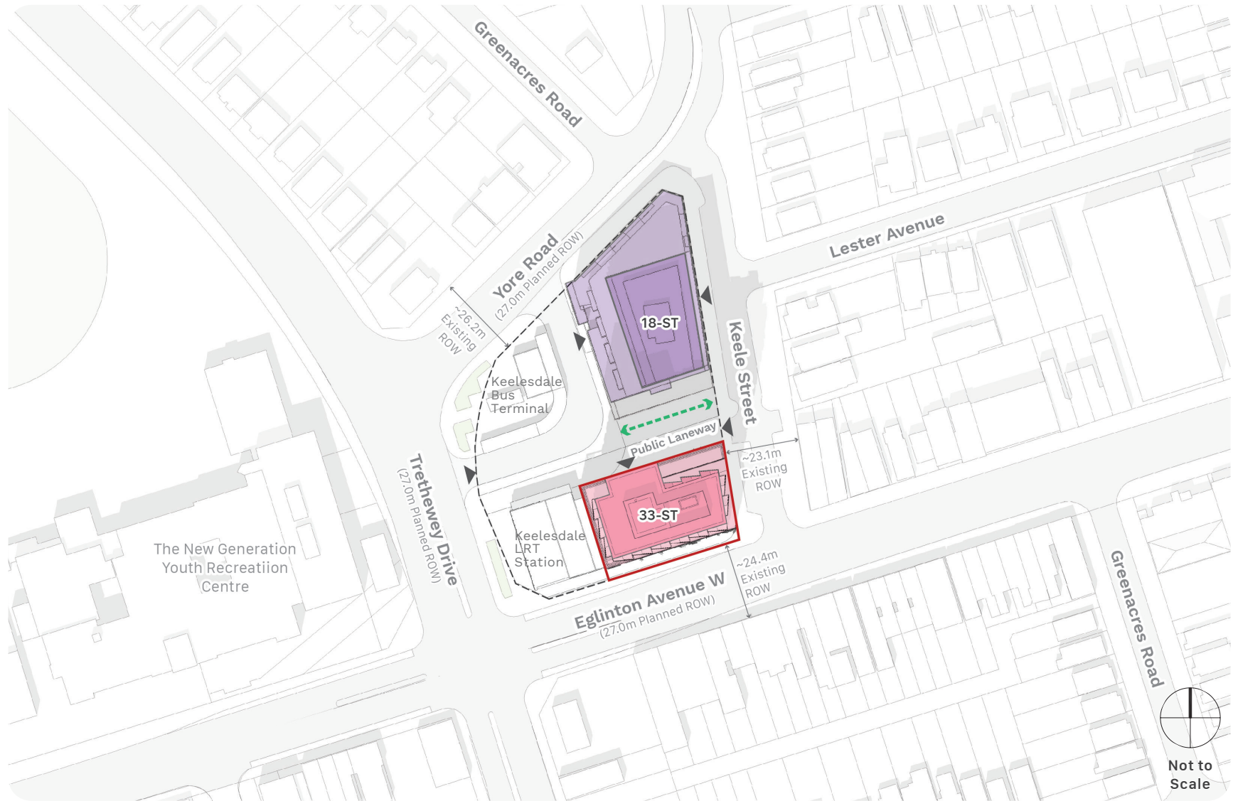
Figure 8 - Vehicular Access